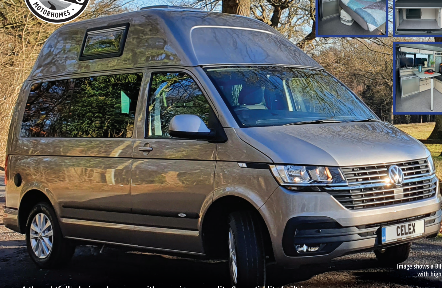
Image shows a Bilbo's Celex with high-top roof.

A thoughtfully designed camper with experience, quality & practicality built in.