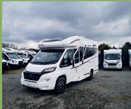
Pre-loved leisure vehicles