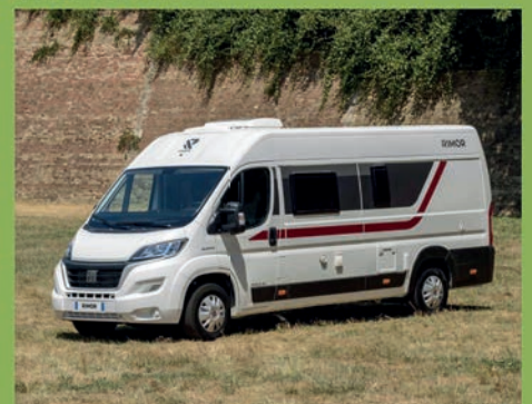
2 - 6 berth hire fleet available

Motorhomes and Caravans Ltd Stoneferry Road, Hull HU7 OEG