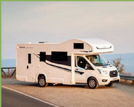
Sole importer of Rimor